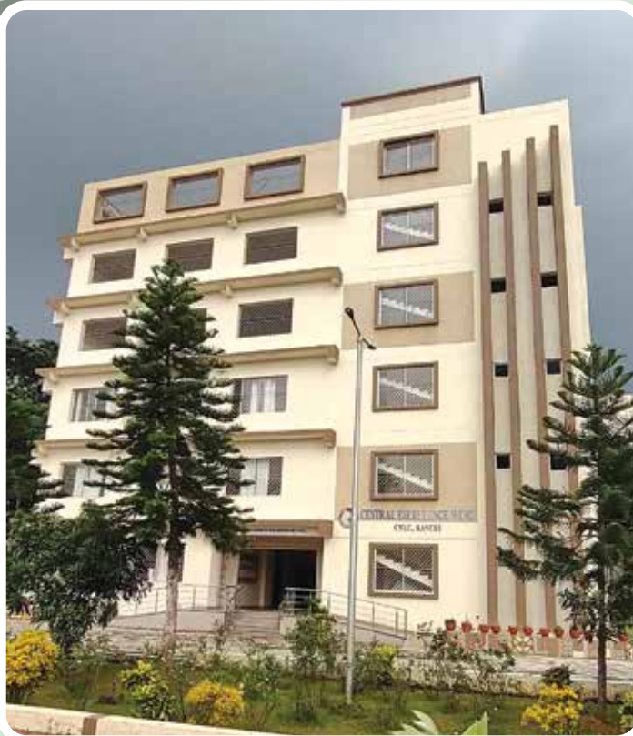
Justice S B Sinha Centre for Legal Research & Excellence (Central Excellence Wing)