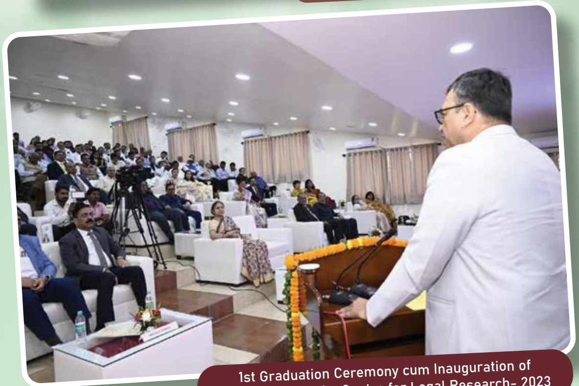
1st Graduation Ceremony cum Inauguration of Justice S. B. Sinha Centre for Legal Research-2023