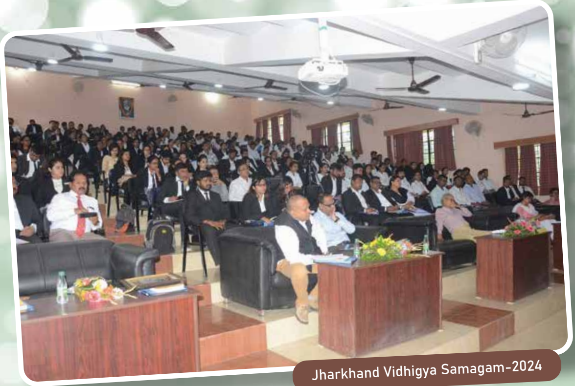
Jharkhand Vidhigya Samagam-2024